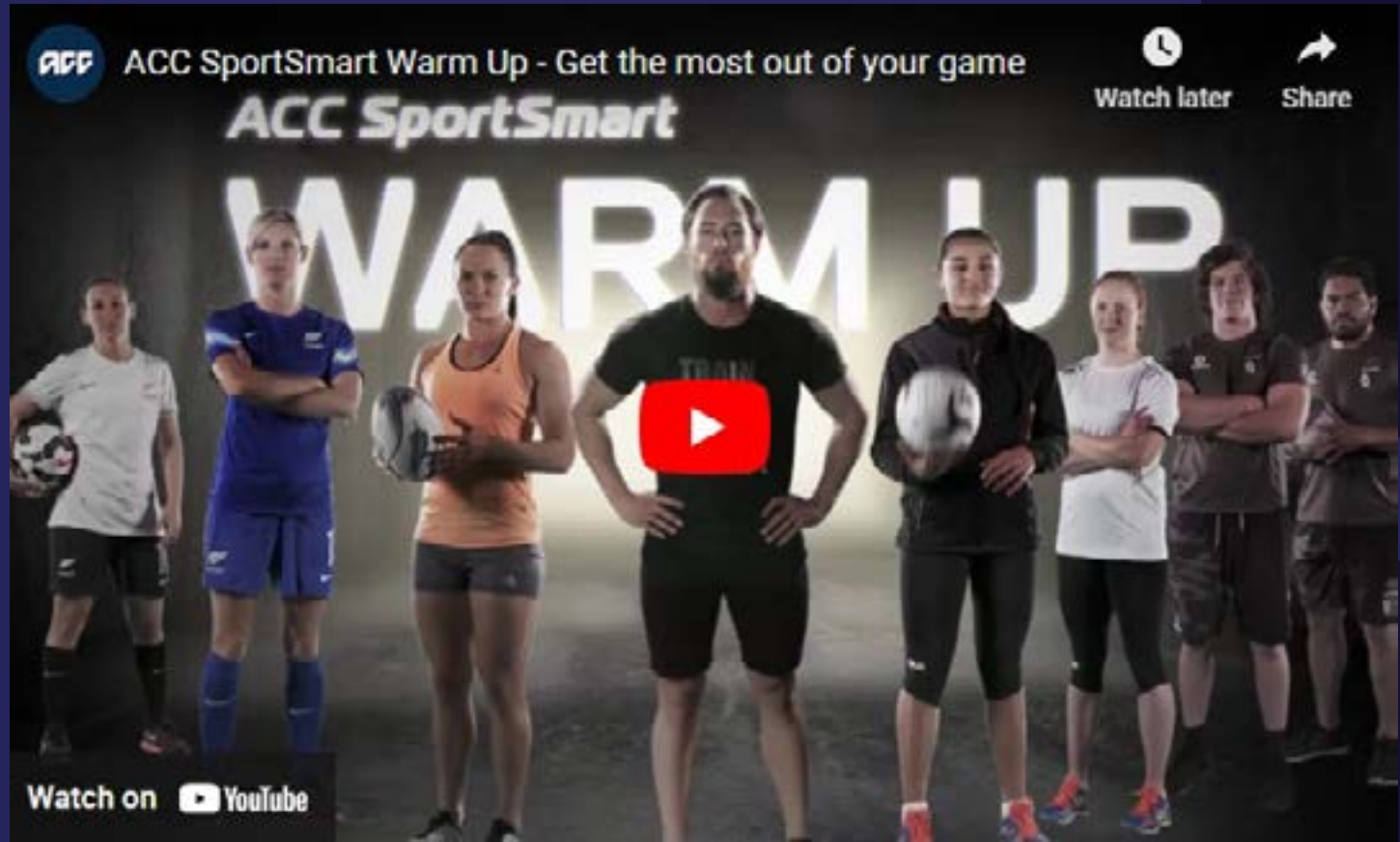
ACC SportsSmart Warm Up